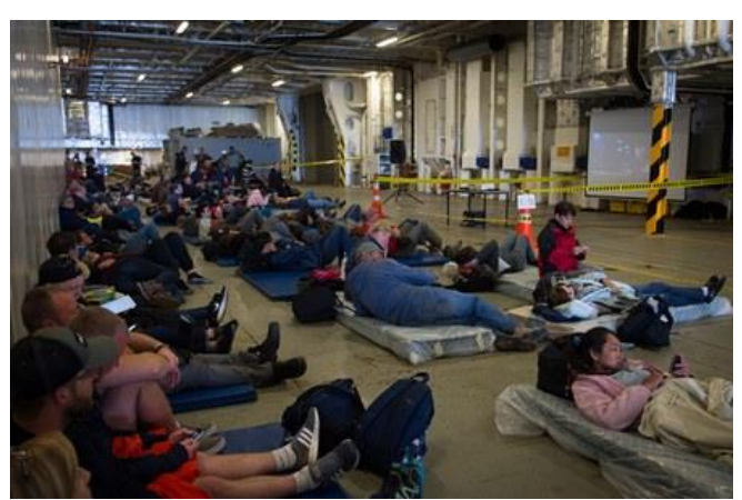
HMNZS Canterbury amphibious sealift ship embarked earthquake refugees from Kaikoura, November 2016.

A New Zealand Defence Force's disaster relief operation swung into action following November's earthquake near Kaikoura and included HMNZS Canterbury and offshore patrol vessel HMNZS Wellington. They were joined by Australian, Canadian and United States warships with their support helicopters.